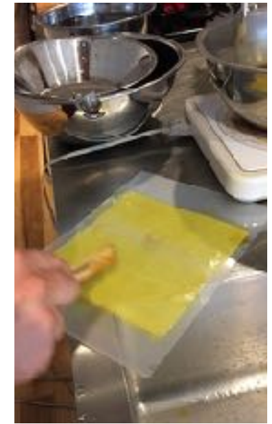
Dye-workshop with wild rubia cordifloria pratensis △making pH7 extraction of Rubia, △dyeing silk with wild Rubia roots, Lithospermum root, Harlequin glory bower, paper with Amur ciorktree