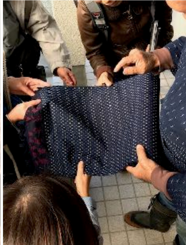
KURUME GASURI MORIYAMA KASURI Studio