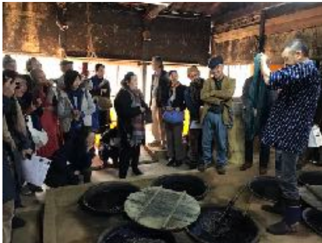
KURUME GASURI Studio YAMAAI