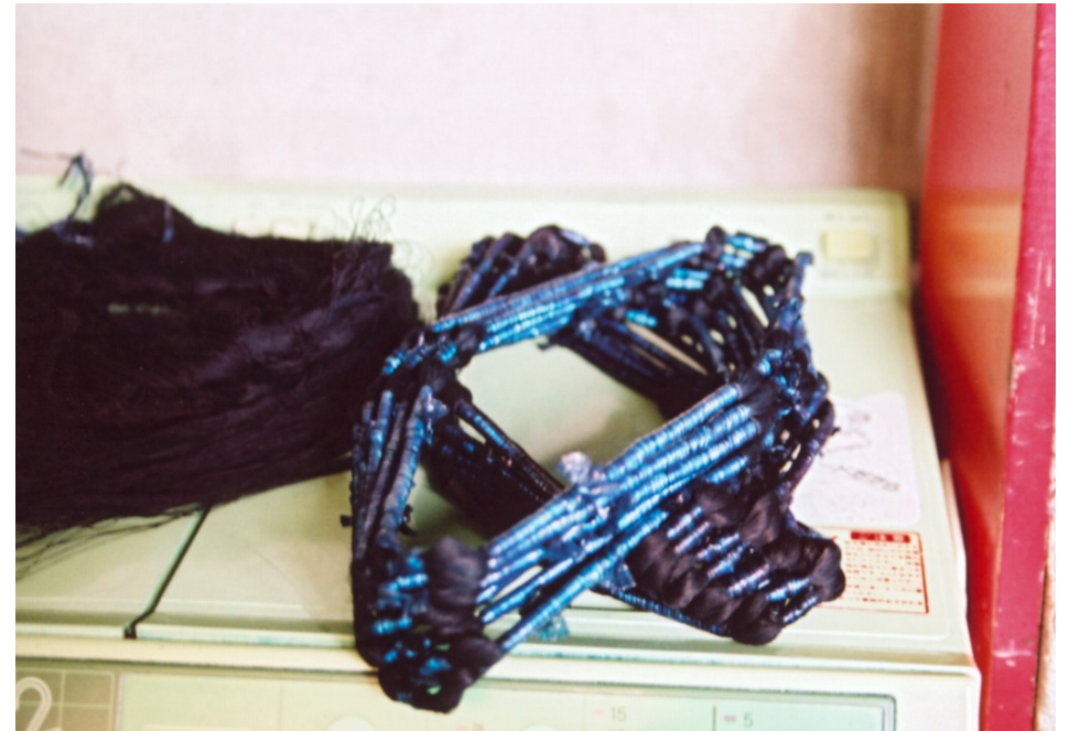
Bashyo yarn for ikat