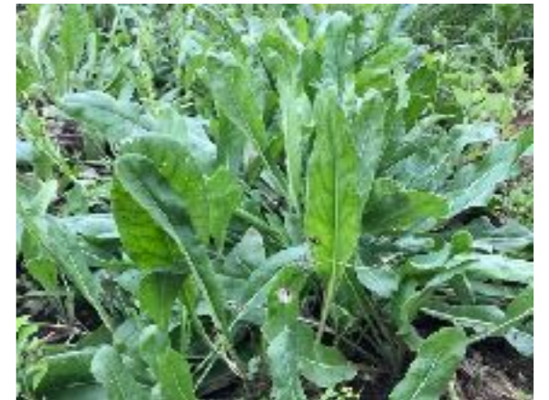
Isatis tinctoria yezoensis