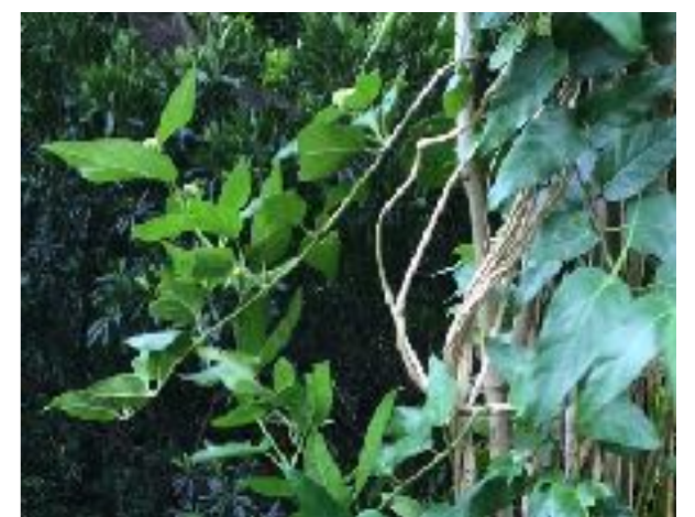
Marsdenia tinctoria tomentosa