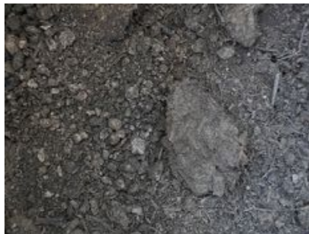
Sukumo fermented with dry leaves and a little water