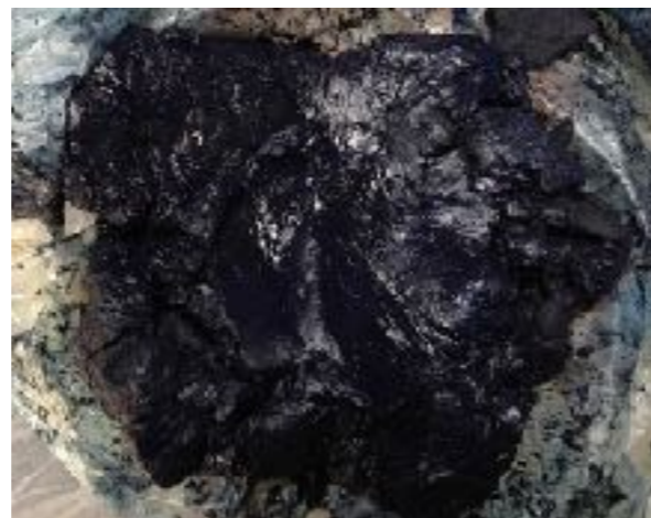
indigo paste extracted in water and oxidized with lime